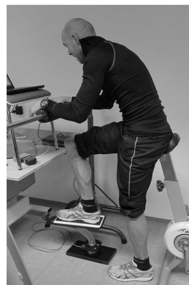
Figure 1: athlete performing the LED test

using the model of the strength dexterity (SD) test for the hand (Valero-Cuevas et al. 2003) and was incorporated in this study. Subjects were asked to compress a slender spring prone to buckling with one foot while the body was stabilized by leaning on a bike-saddle with the upper body supported by the arms on a bar in front (see figure 1). The participant's weight is evenly distributed between the bike saddle and the support leg, allowing for isolation of the test leg. Subjects were provided visual feedback on a screen in front of them and were advised to produce a maximal compression force for at least ten seconds. Ten trials were performed and the mean of the five [[we used the best three]] best trails was calculated. This maximal level of compression (< 15% of body weight) is an indicator of the maximal instability the isolated leg can control during ground contact (ICC = 0.94).